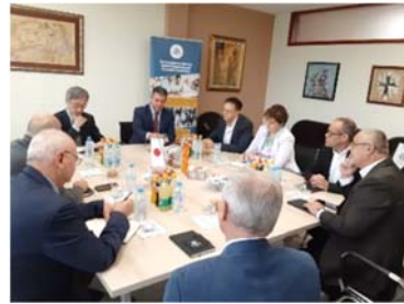
Venue of EFAAS Meeting

An EFAAS Meeting was held on the following day and delegates from Czech, Georgia, Hungary, Romania and Turkey participated in the meeting. After the session of reporting current activities by member societies, the participants have opportunity to discussed topics such as collaboration activities to enhance strong network among EFAAS members, and movement to consider the establishment of new alumni societies in Serbia, Montenegro, and Bosnia and Herzegovina.