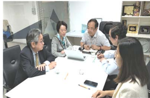
Review meeting in Vietnam