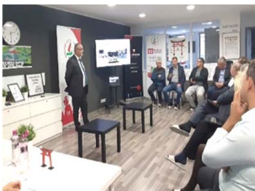
Latest visiting opportunity of their office by AOTS staff – scenery of alumni society's meeting in November 2023

Besides, the participants have a chance for visiting Japanese elementary school which is well known for the education method that fosters students' independence, and the participants observed student activities such as cleaning and serving school lunches by students themselves. This session was realized by the strong request from the Hungarian Alumni Society which has long been involved in "5S public" activities in cooperation with students, parents, and teachers at elementary and secondary schools in Hungary. In August 2023, when AOTS had an online meeting with the board member of Hungarian Alumni Society, we were impressed with their plans to expand the number of schools involved in public 5S activities in the future.