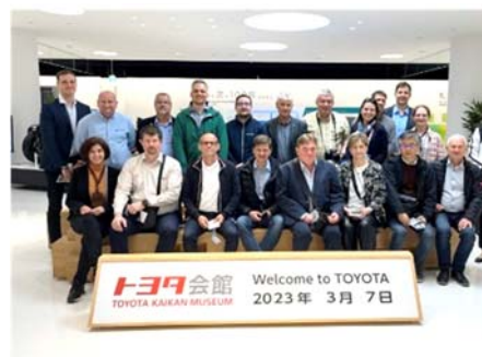
The participants of program in March 2023