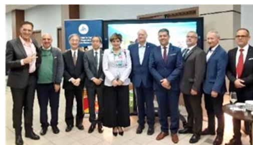
Photo taken with EFAAS delegates and other participants