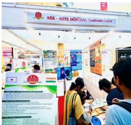
Scene of the venue: visitors trying their hand at a game using Japanese chopsticks (shown in the right side)

In November 2023, Japan Expo was held in Chennai, India sponsored by ABK AOTS DOSOKAI along with Consulate General of Japan in Chennai. The event showcased the diversity of Japanese culture through exhibits and demonstrations-not only