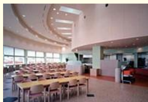
Our cafeteria serves vegetarian and halal meals as well.

AOTS Kansai Kenshu Center (KKC) 7-5, Asaka 1-chome, Sumiyoshi-ku, Osaka-shi, Osaka 558-0021 (Near Abiko Station / Sugimotocho Station)