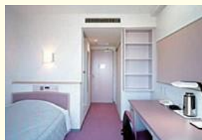
Single room with en-suite bathroom