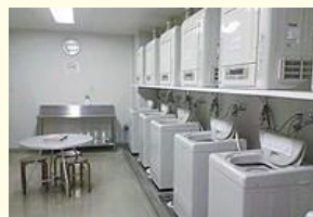
Washing machines and dryers are available for free.