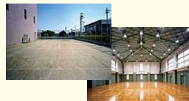
Participants also have access to a tennis court and gymnasium.