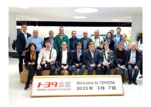
The participants of program in March 2023

plans to expand the number of schools involved in public 5S activities in the future.