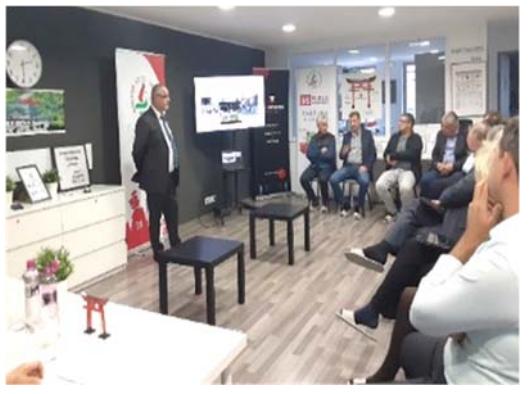
Latest visiting opportunity of their office by AOTS staff – scenery of alumni society's meeting in November 2023

Besides, the participants have a chance for visiting Japanese elementary school which is well known for the education method that fosters students' independence, and the participants observed student activities such as cleaning and serving school lunches by students themselves. This session was realized by the strong request from the Hungarian Alumni Society which has long been involved in "5S public" activities in cooperation with students, parents, and teachers at elementary and secondary schools in Hungary. In August 2023, when AOTS had an online meeting with the board member of Hungarian Alumni Society, we were impressed with their