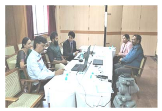
Business matching in Chennai, India

We hope to continue and deepen our partnership and cooperation with the AOTS Alumni Societies, which is an important overseas resource for AOTS.