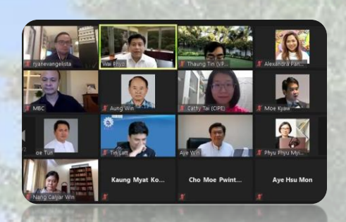
Advocacy Capacity Building Meeting, 2020

✓ Representing and safeguarding the interests of the private sector