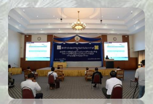
Covid-19 Awareness Program, 2020