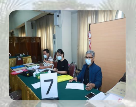
3<sup>rd</sup> Covid Loan, 2020