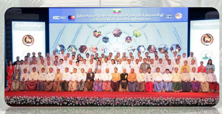
27<sup>th</sup> Annual General Meeting, 2018